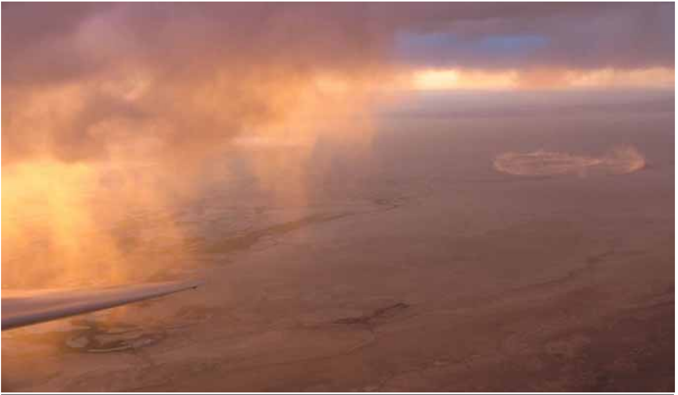
Micro downburst on the desert floor; a remarkable photo by Brian Choate