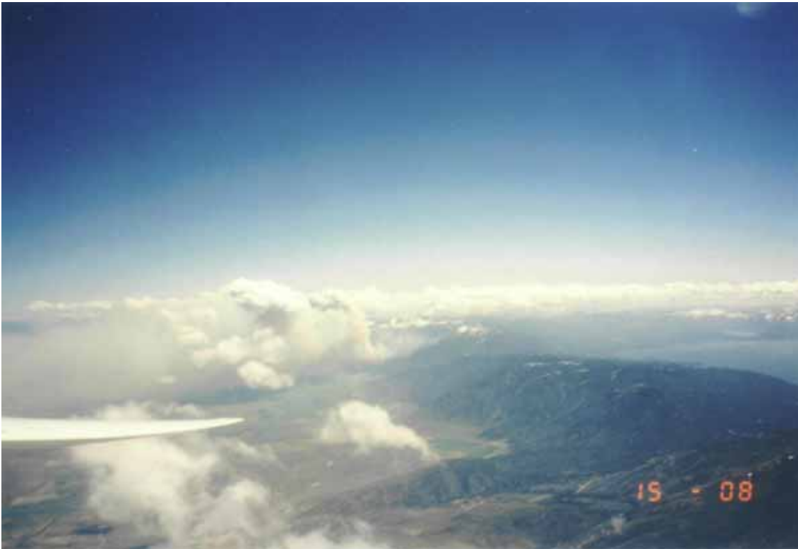
Fire west of Alpine County Airport forming two clouds.

However, it works all right and I find four knots, petering to two at 10,500'. I move a couple of miles and reach 11,500', and sneak out in the Carson Valley towards Mineral Peak, which I reach below 8,000'. I see many clouds at Mt. Patterson, and even a couple near Topaz Lake. A fire west of Alpine County Airport forms a couple of clouds. The smoke drifts innocently to the east, but it affects only a small part of the lower Minden valley.