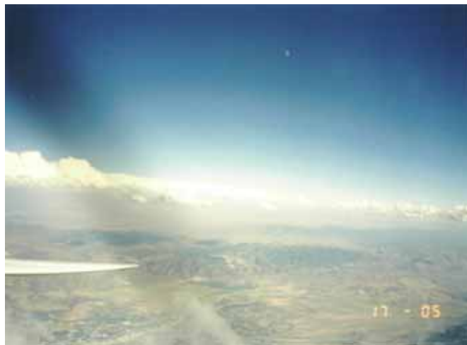
In the Reno valley now, looking back: much clearer skies. The Moon above says it's OK.

mostly at my back, and it extends from the Sweetwater Range to the middle of the Carson Valley, while everywhere else the air is clear. When I have 1000' above glide I increase my speed inputting 2 knots in the McCready. Over the Tahoe ridge, McCready at 4. Over Lake Tahoe, at 6. Then 100 knots irrespective of the McCready up to the landing pattern.