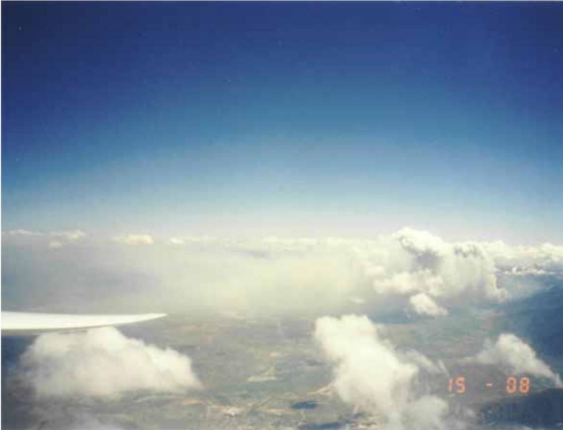
Smoke drifts innocently across the lower Carson Valley.

that the clouds are aligned in distinct convergence zones, more extended in the south direction. I see no clouds to the east of Mono Lake as well as over Boundary Peak. The clouds instead go directly in the direction of Schulman Grove.