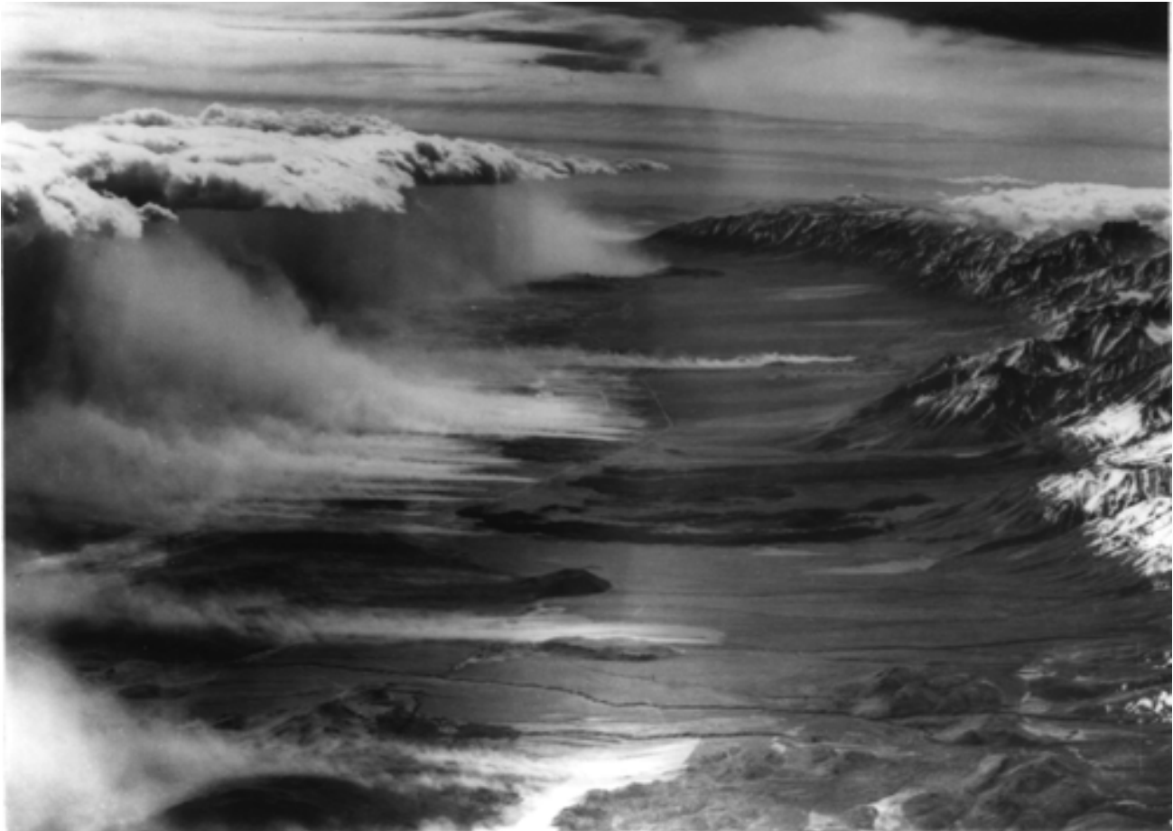
Sierra Wave; Owens Valley looking South.

The Immortal Photo (Bob Symons) taken from a feathered-prop P-38 in wave in the '50's