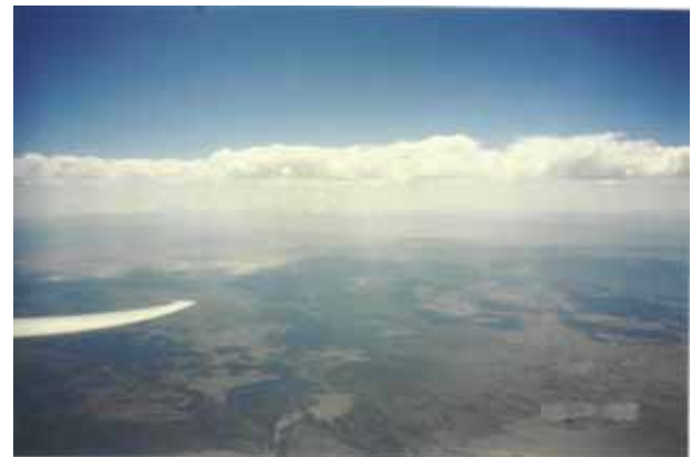
On the way back, east of Mono Lake.

but I can't tell if there are clouds on the Pine Nuts. I find good clouds and good lift at the Sweetwater