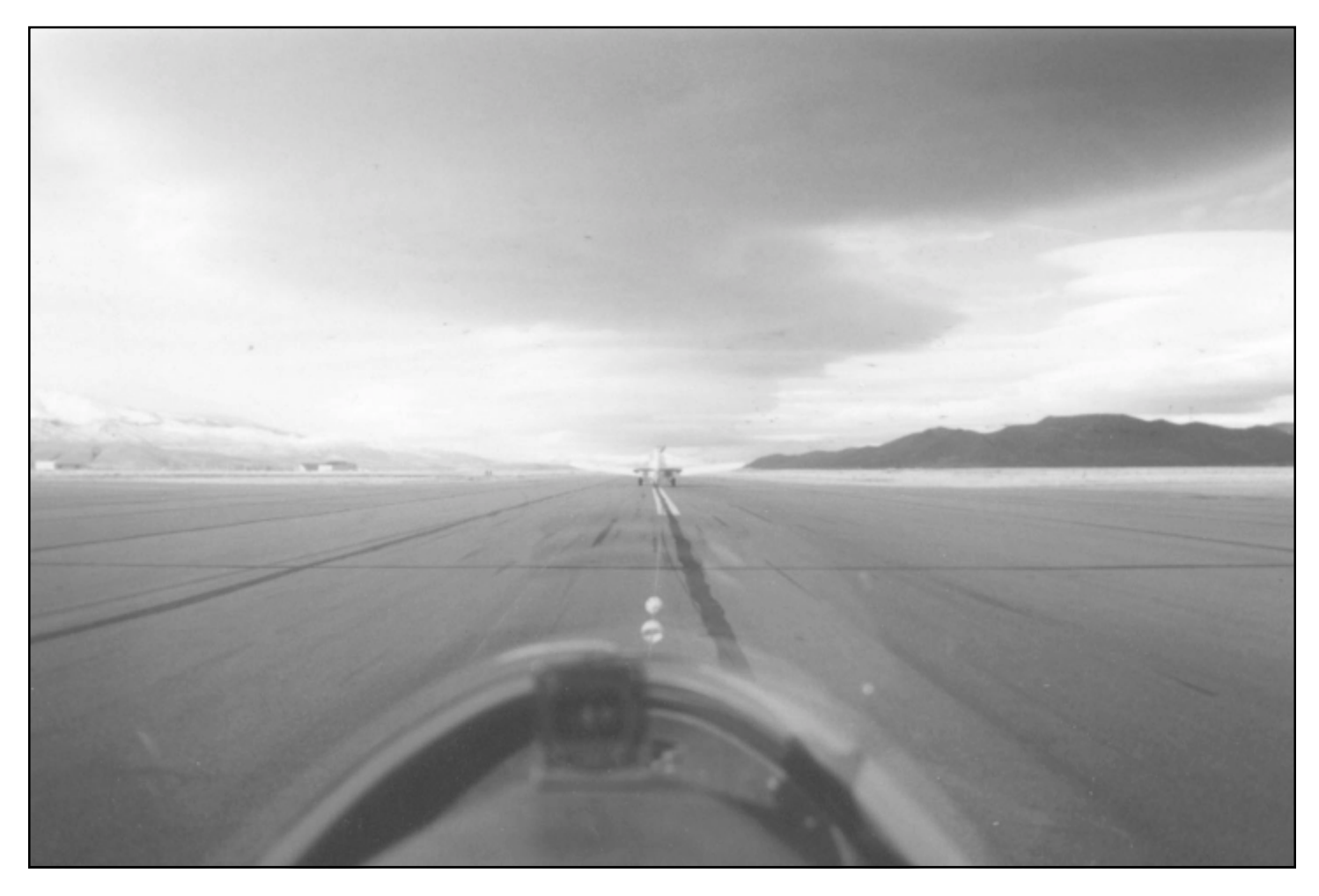
Set for tow into the Minden wave - Photo by Steven Ascher