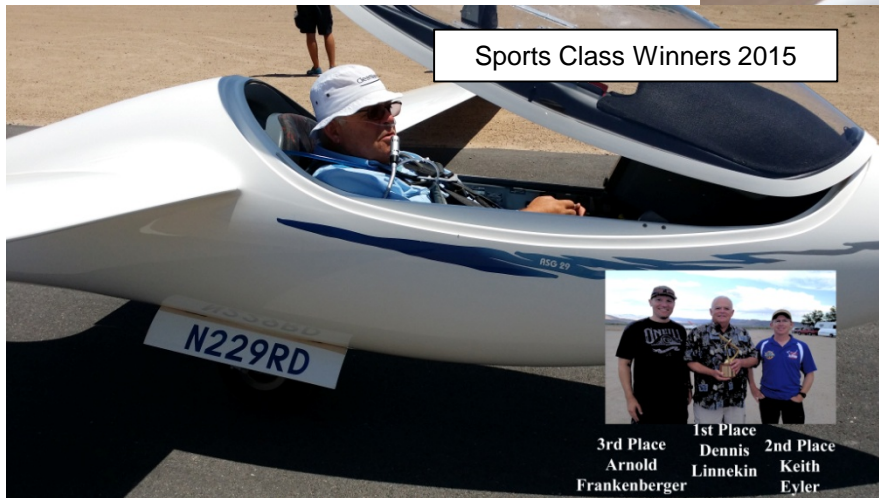
Sports Class Winners 2015